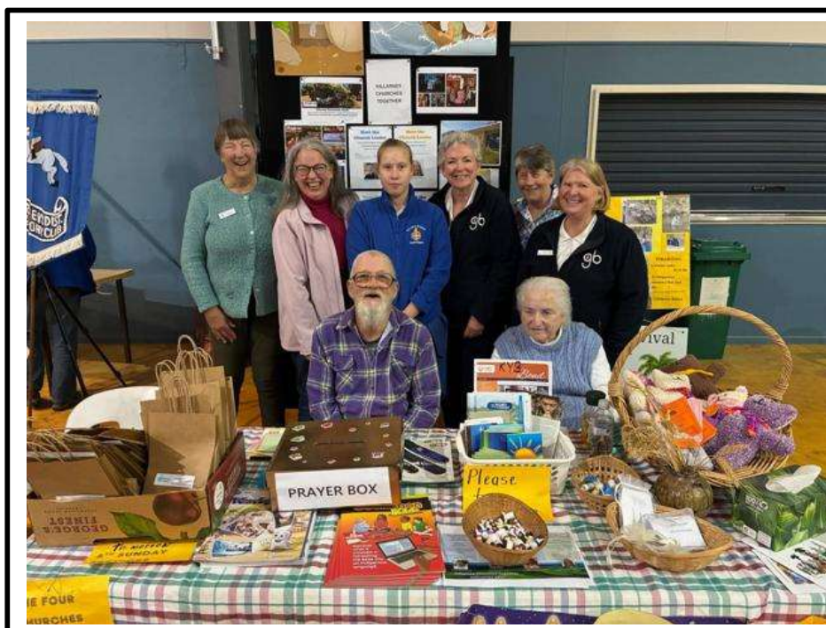
The K team at the Killarney Expo last Saturday.

What is our response? All we need is faith and tumbling walls!