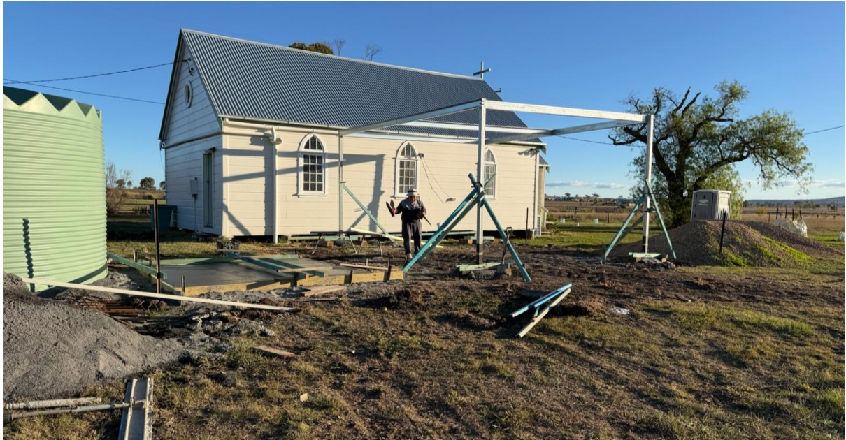
Work for the new Toilet block at Freestone is finally underway.

Welcome to worship on Pentecost 3. May God bless us today as we join online or in the pew. Please stay to share a chat and cuppa afterwards.