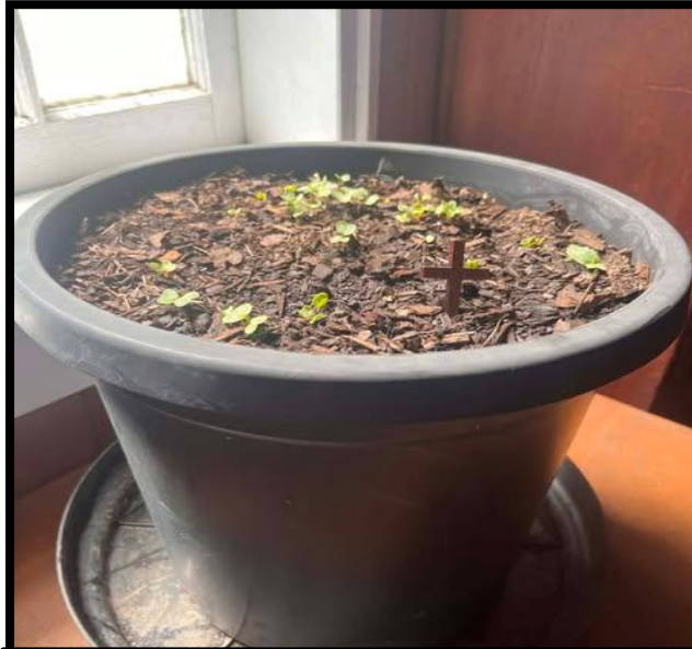
Planted on Good Friday at Freestone On 10 th May very healthy radish plants.

Welcome to worship on this seventh Sunday of Easter. May God bless us today as we join online or in the pew. Please stay to share a chat and cuppa afterwards.