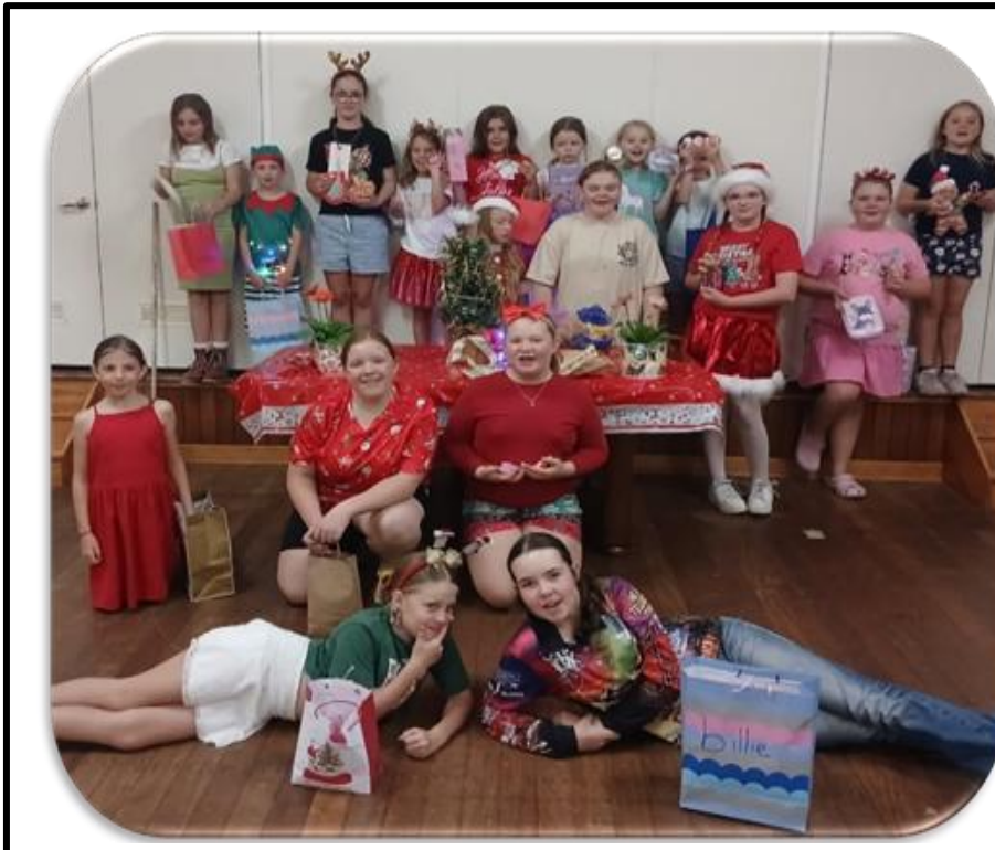
CELEBRATING KILLARNEY GIRLS' BRIGADE 2025

Welcome to worship, may God bless us today as we join online or in the pew. Please stay to share a chat and cuppa afterwards.