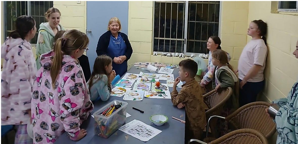
KILLARNEY GIRLS' BRIGADE CAMP FUN AND LEARNING

Welcome to worship as we continue to journey with the disciples after the crucifixion on this seventh Sunday after Pentecost. May God bless us today as we join online or in the pew. Please stay for a chat and a cuppa.