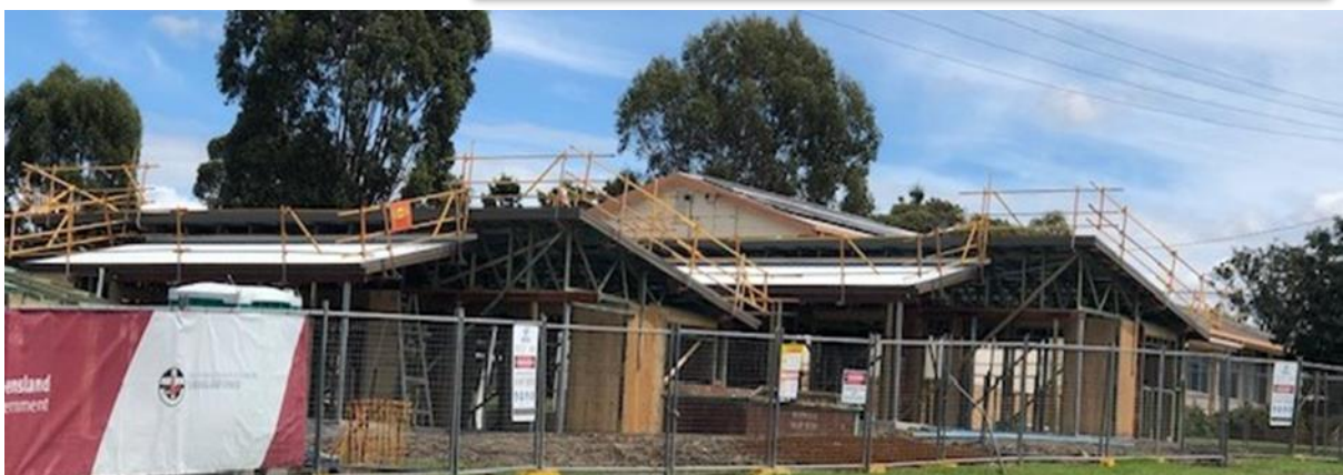
Up to the roof on the Affordable Housing Units in Killarney.