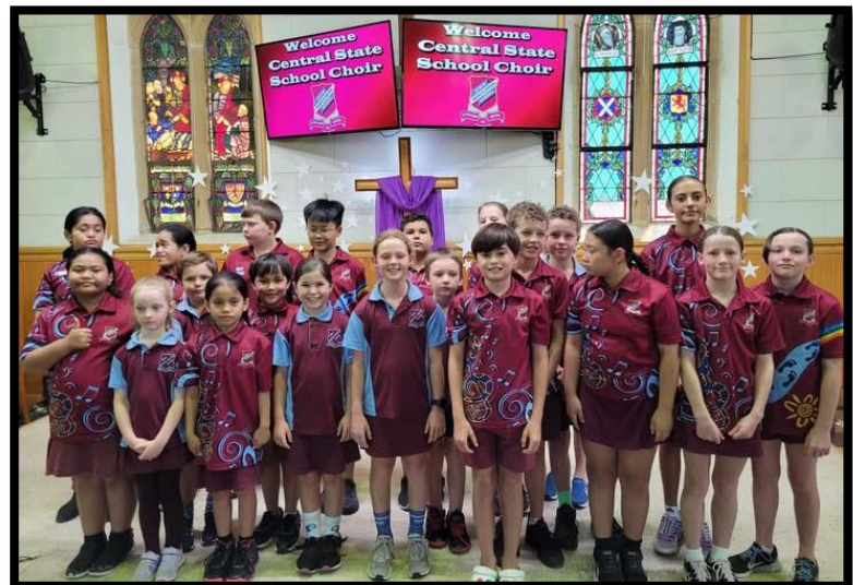
Warwick Central Choir entertain at the Market Day