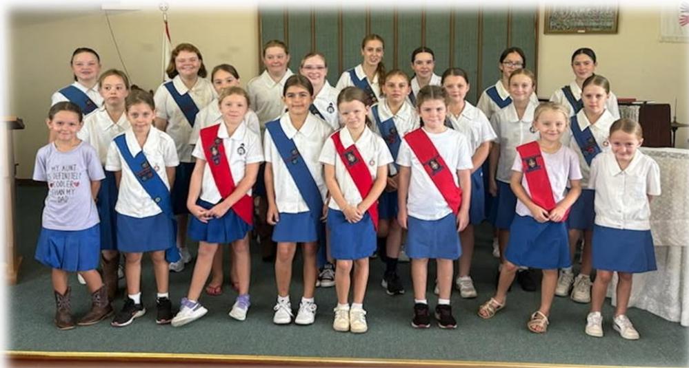
Killarney Girls' Brigade sing during Harvest Festival Service Sunday 23 rd March