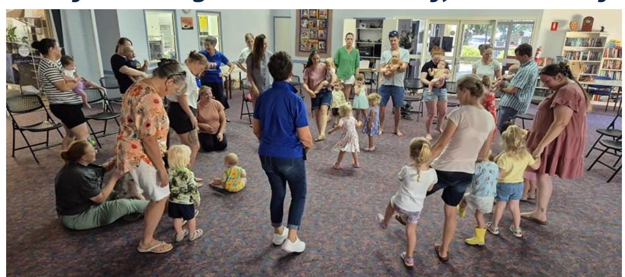
Put your left foot in!