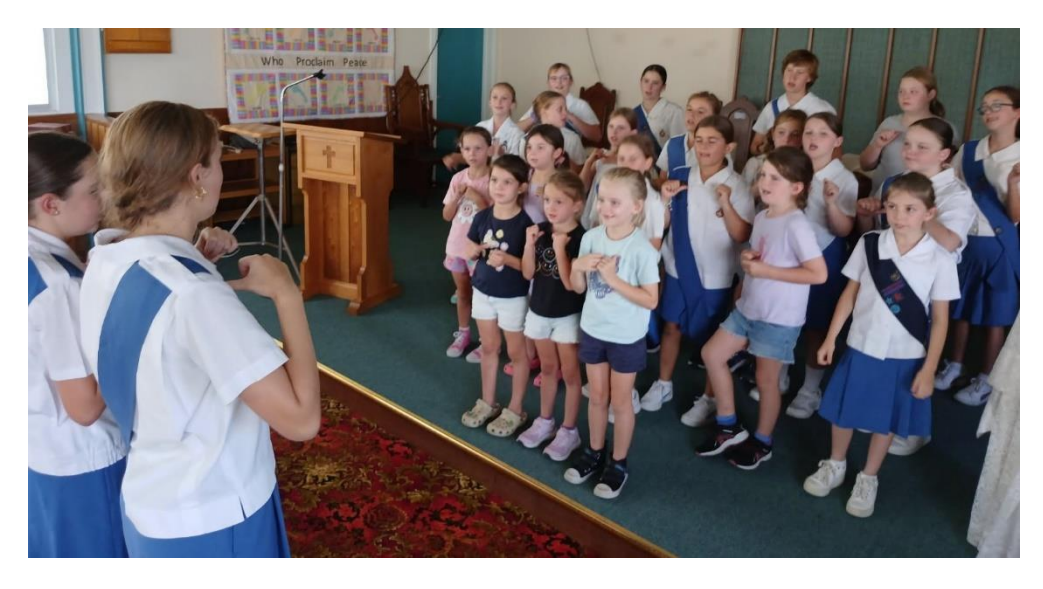
Girls Brigade - we love singing