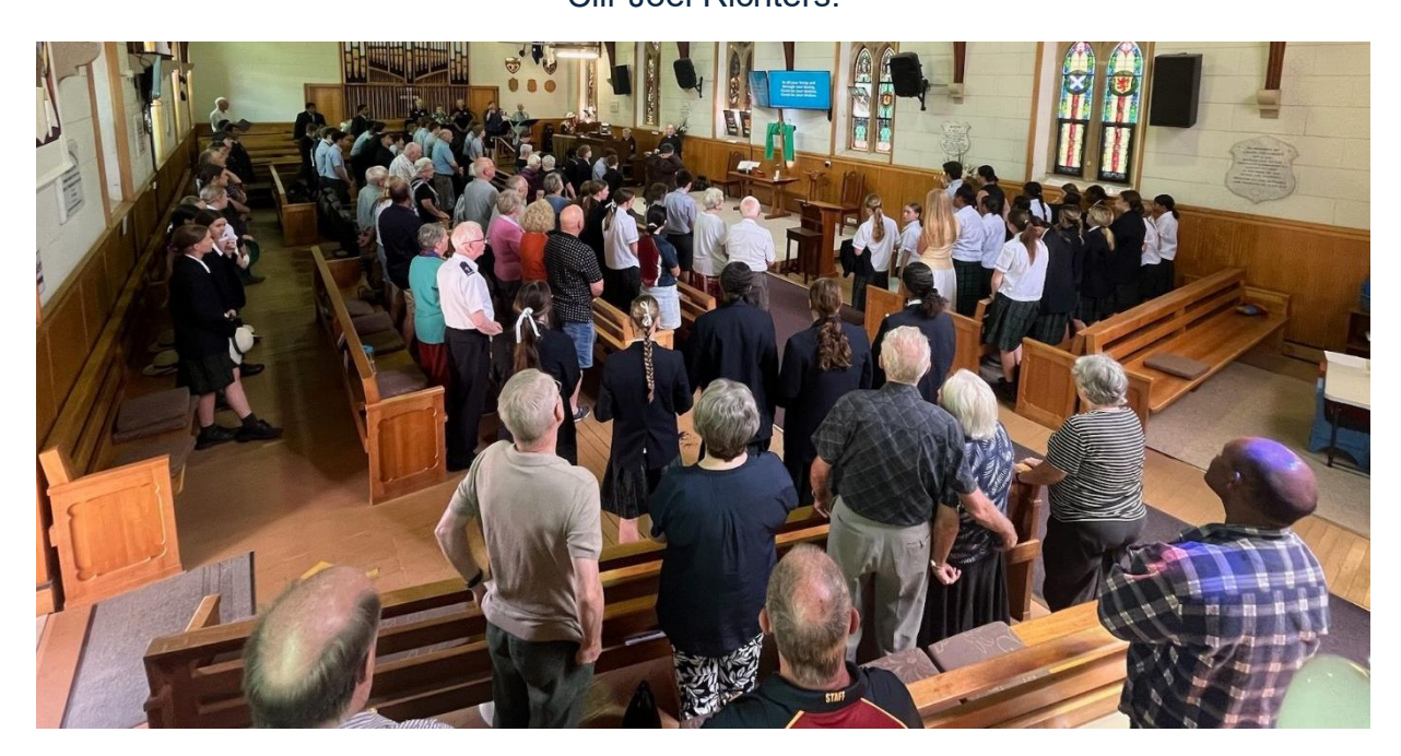
Scots PGC in Worship