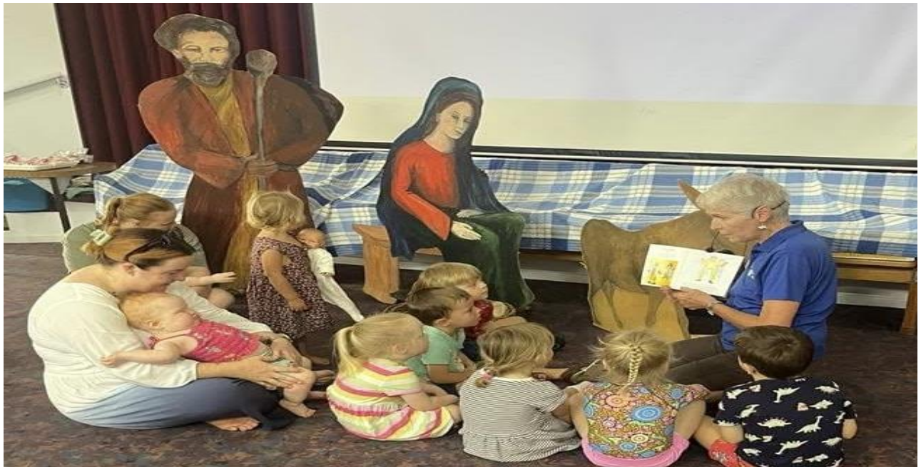
Sharing the Christmas Story at Warwick mainly music

Welcome to worship on the second Sunday in Advent. May God bless you today as you join either online or in the pew. Please stay for a chat and a cuppa after the Service.