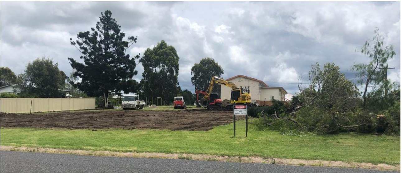
Work begins in Killarney.