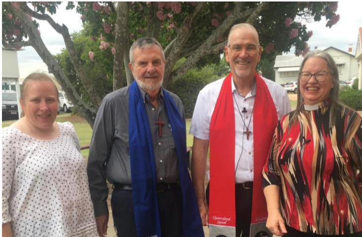
Presbytery in worship

REJOICE and SEE LISTEN ACT FEEL CELEBRATE