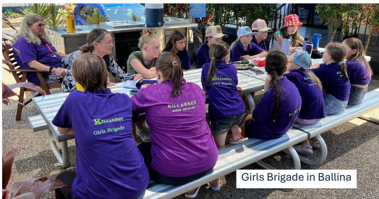
Girls Brigade in Ballina