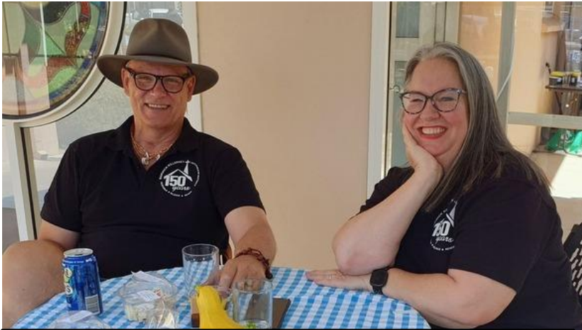
Our Coffee Connoisseurs – still waiting!