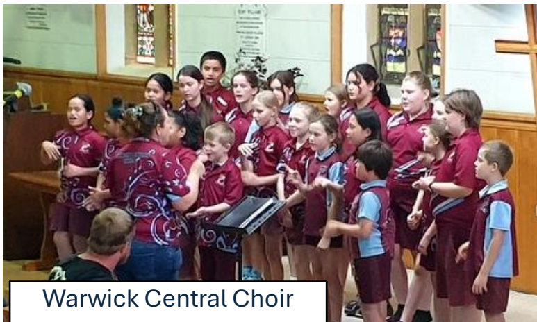
Warwick Central Choir