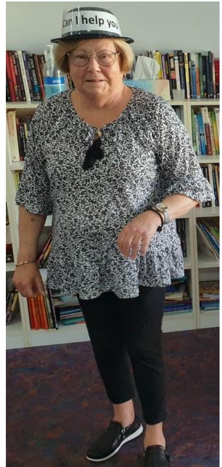
The hat fits!