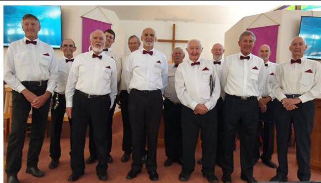
Toowoomba Male Voice Choir – leading worship next week in Warwick.