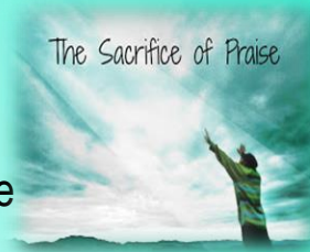
The Sacrifice of Praise