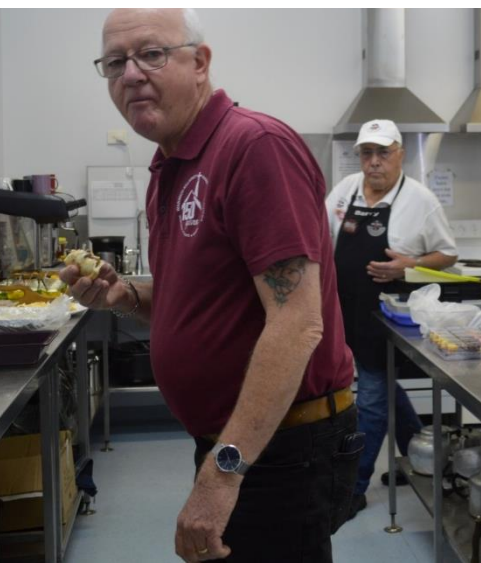
I'm not coming out of the Kitchen.