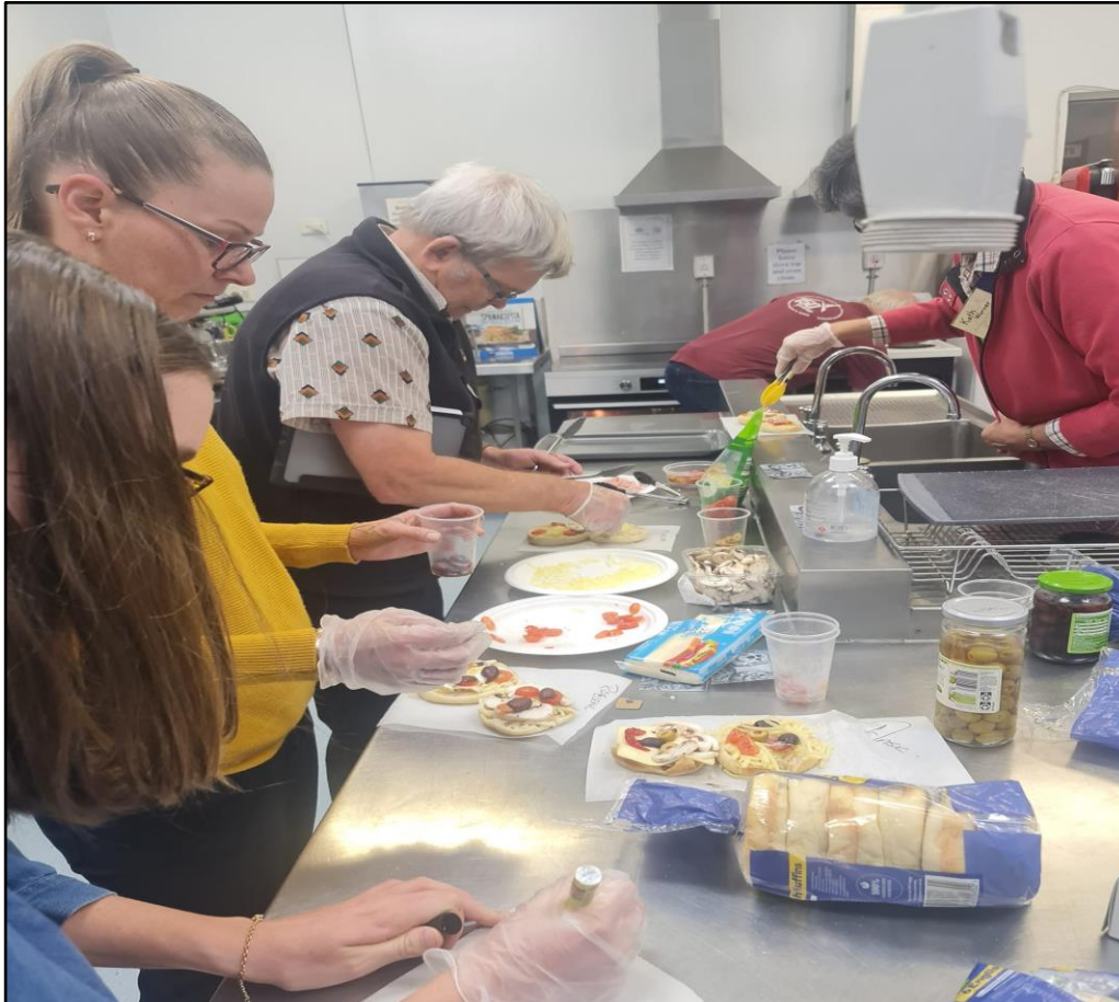
Intergenerational Church – making pizza faces.