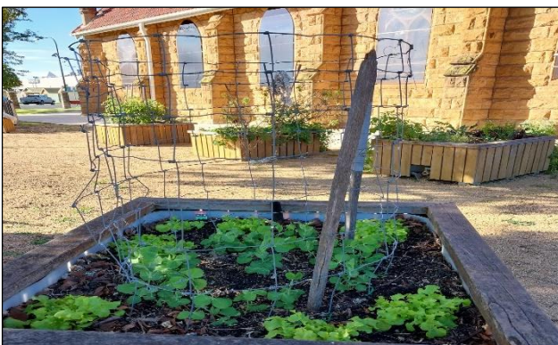
God's Garden planting for winter