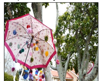
2022 Display 'Showers of blessings'

Contact any of our Council members with your creative ideas and offers to be involved.